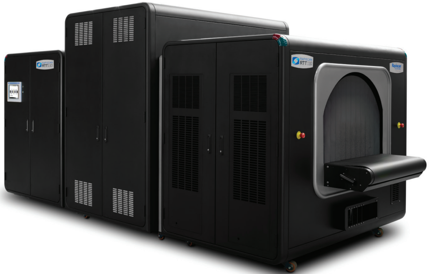
Tunnel Opening (width x height): D-shaped 1020 x 756 mm (40.2 x 29.8 in)